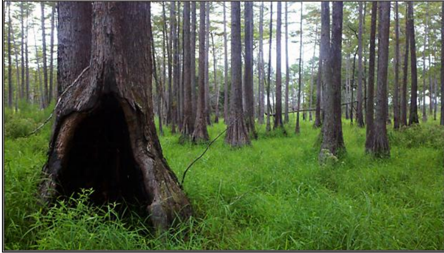
The conservation easement on the 417-acre Leary Farm tract in Calhoun County focuses on sustainable forestry and wildlife management.