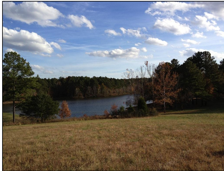
The Groton Place conservation easement in Oglethorpe County protects 366.7 acres that include several diverse ecosystems and hiking and mountain biking trails.

One of the most frequently cited motivations for property owners to place conservation easements on their land is tax incentives. Federal and state tax incentives are standardized and generally somewhat predictable. In Georgia, local property tax incentives for conservation easements are not standardized and may be unpredictable. Although state law requires tax assessors to consider the effect of a conservation easement when valuing land, the complexities of valuing the impact of the easement can make this a daunting task. Valuation methods for these properties can vary from county to county and easement to easement, and this unpredictability serves as a disincentive for the use of conservation easements in the state.