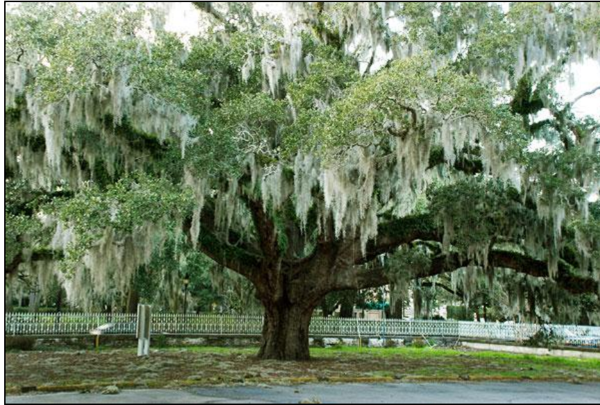
The Candler Oak, a 300-year-old live oak in Savannah, is protected by a conservation easement held by the Savannah Tree Foundation.

Conservation easement properties can also be enrolled in CUIVA or Super CUIVA. Indeed, many conservation easement properties that qualify for state and federal tax benefits will have the characteristics necessary for inclusion in a CUIVA or Super CUIVA program. xlv For a conservation easement property that is also enrolled in one of these programs, the ad valorem tax valuation method under the program is appropriate. This is the only situation in which using one of these methods is appropriate for a conservation easement property.