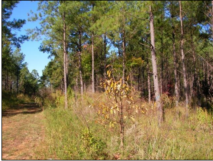
The Lakeridge conservation easement in Jones County covers a 481-acre tract on which foresting activities are preserved and governed by a forest management plan.