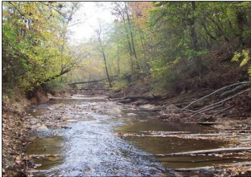
The Rivermont conservation easement in Johns Creek protects a 27.4-acre park on the Chattahoochee River, providing permanent recreational opportunities for community residents and water quality improvements downstream.

Appropriate, predictable easement valuation can encourage easement use in communities, which can in turn provide important benefits to local governments. First, conservation easement encumbered property can actually increase the value of other land in the community, which can have a net positive benefit for local tax revenues. Under the “betterment theory,” land adjacent to property that is permanently conserved becomes more valuable to prospective buyers because they know that development will never occur on the conserved land. xx People value open space, so they are willing to pay a premium for land adjacent to permanently protected natural or agricultural/timber areas. When the FMV of property adjacent to conserved property increases, so do local tax revenues. In addition, easement encumbered property will not likely need the expensive infrastructure and services required by developed areas; although local governments may receive less tax revenue from these properties they avoid having to provide expensive services. This is particularly important for conserved land that would otherwise be developed for residential uses, as studies consistently show that the cost of providing local services to residential developments exceeds the tax revenues these properties generate. xx Cost of community services studies conducted in Georgia show the same results. xxi