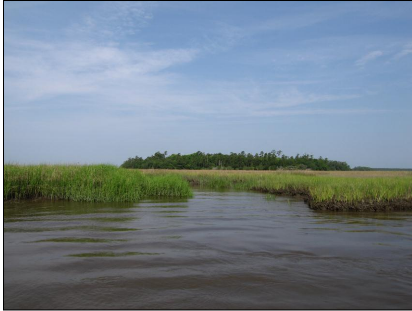
The Jelks Pasture conservation easement in Liberty County is a 5,285-acre tract, the permanent protection of which will conserve maritime forests, coastal hammocks, and tidal marshes.